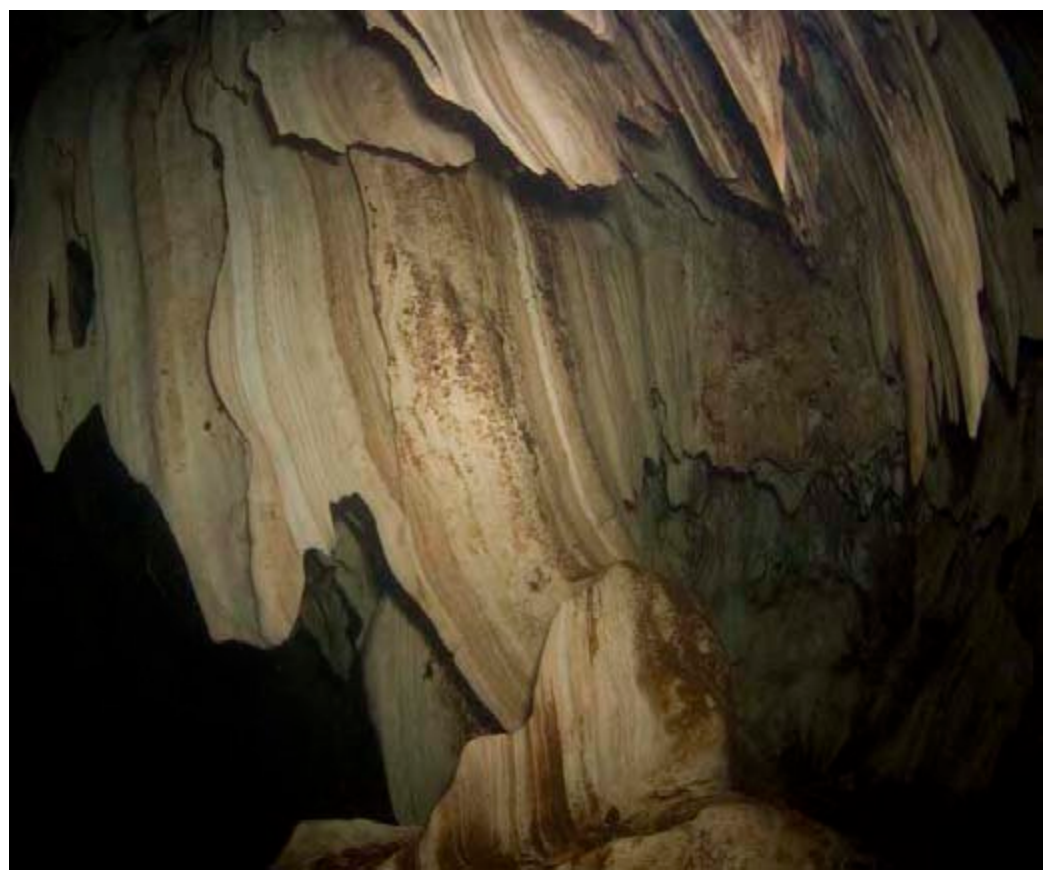
SubalNikon D200, 10.5mm lens, Inon strobes, 1/13th sec @ F2.8 ISO 500

Rising with the dawn, I'm eager to get in the water again, the nights ruminating over todays challenge has offered little other than to treat the whole dive as if night diving and not get frustrated. Relax, enjoy the dive and do my best was the attitude I submerged with and it proved to be the right one. When I couldn't get the camera to focus, I let it be and enjoyed what I was seeing. I surfaced with some interesting results but it's obvious that my next trip here will involve two strobes and a little more buddy participation. I believe disconnecting one strobe from its arm would give some fantastic results but